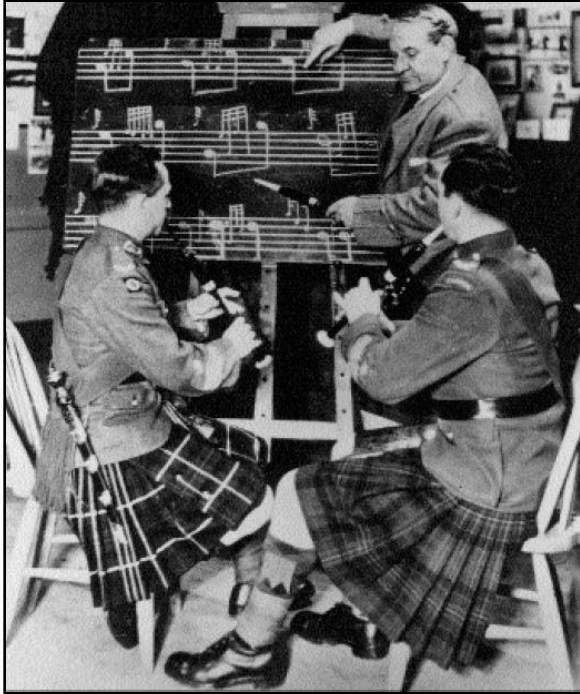
Chanter Practice at the Castle