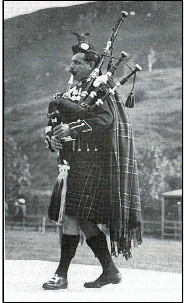
Pipe Major Willie Ross

Familiar and well-loved tunes, each was written by famed Pipe Major Willie Ross.