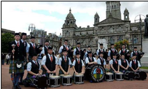
The Band poses at George Square, Edinburgh, Scotland