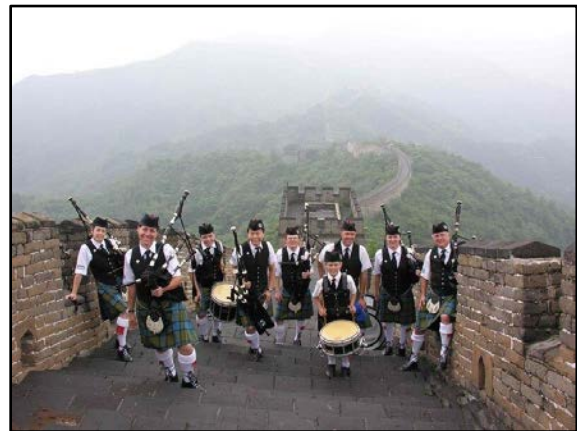
The Band poses on the Great Wall of China

The band loves to travel, and we have had several wonderful experiences, including a 2007 trip to Beijing, China, where we participated in a pre-Olympic cultural festival, representing Pasadena as a Sister City to Beijing Xicheng District.