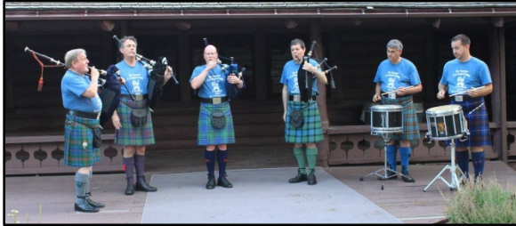
2017 instructor recital

Students also get the benefit of three nights of instructor recitals on Saturday, Sunday and Monday nights.