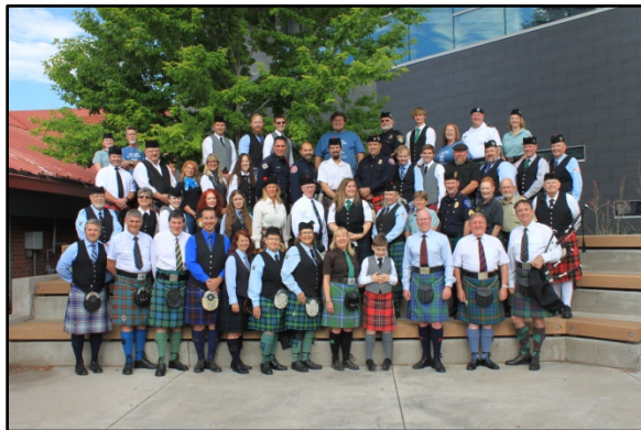
2017 Workshop class photo

Despite what many think of Arizona, Flagstaff is not in the desert but in the mountains of the pine forest with an average high temperature of 78 degrees in July during the school.